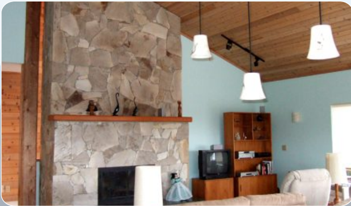
Fireplace in Living Room