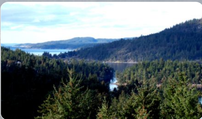
View of Main Harbour to Nelson Island