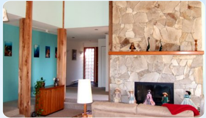
Foyer to Living Room