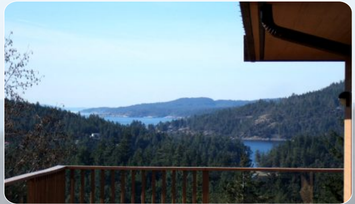
View from Deck