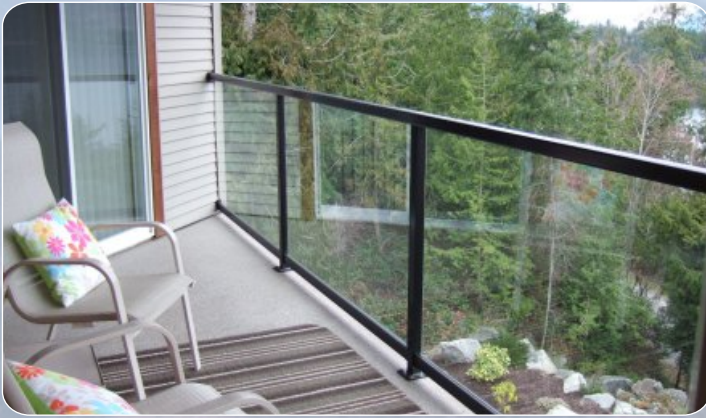
Deck and Garden Below