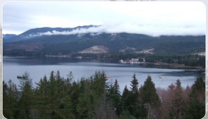
Sechelt Inlet View