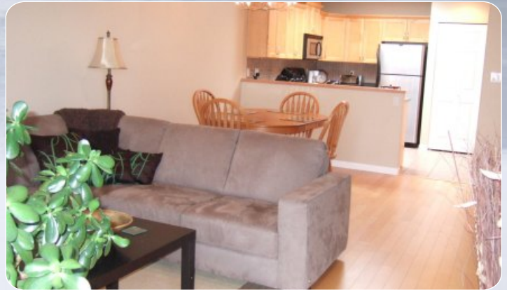
Living, Dining, Kitchen