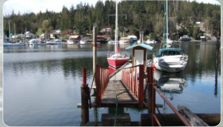
Ramp and Dock