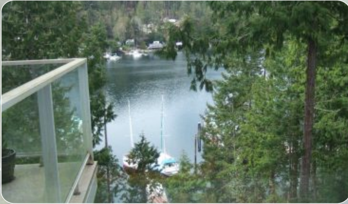
Dining View over Bay and Dock

Offering some of the best moorage in Pender Harbour!